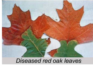
Diseased red oak leaves