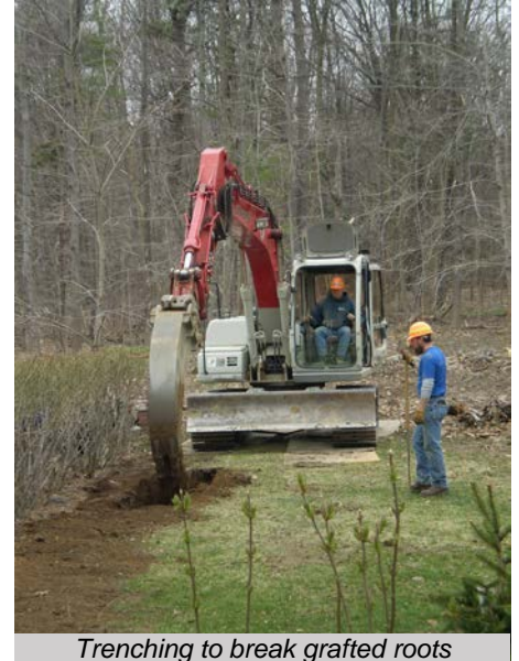
Trenching to break grafted roots