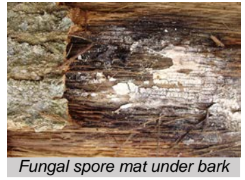
Fungal spore mat under bark